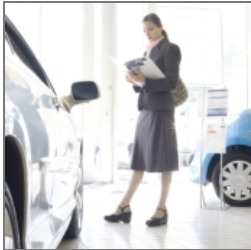
In Depth: How To Avoid Car-Dealer Rip-Offs

The well-informed, confident consumer gets the best deal.